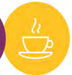
GOING FOR A COFFEE OR A MEAL