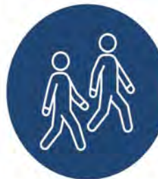
GOING FOR A WALK

Activities create conversation. Find an opportunity during everyday life activities to start the conversation and ask them how they are really feeling. Try doing activities together such as: