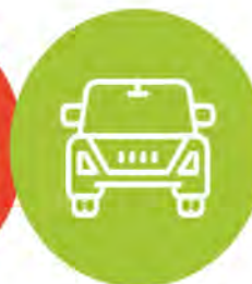
GOING FOR A DRIVE