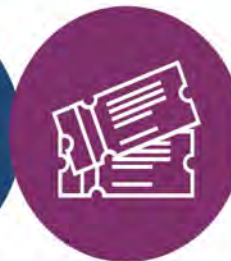
GOING TO AN EVENT TOGETHER