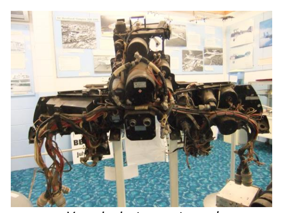
De Havilland Vampire T.35 airframe