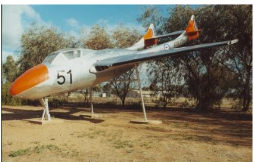
Vampire before and after painted by David Paton for Beverley Air Show, 2000